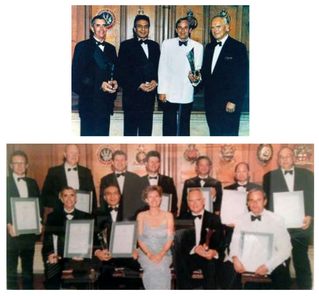
Winners of Seatrade Awards, 1999

The new hook combines increased safety to the operator and lifting operations in more adverse weather conditions.