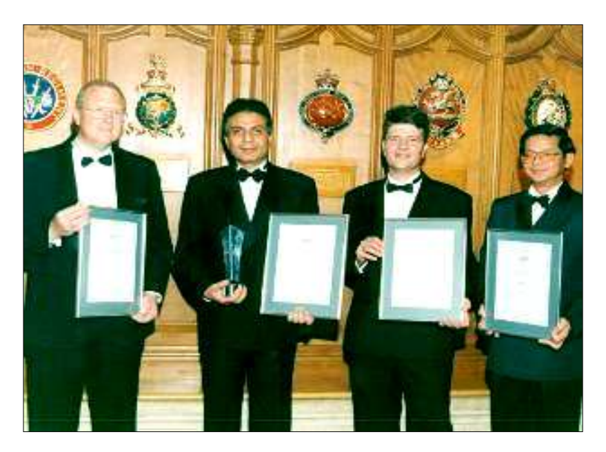
The four runners of the Innovation Category, from the right: Singapore, Holland, Egypt (the Winner) and USA

The system improves clearance from five min/truck (1988) to 25 sec/truck (1997) amidst an eight-fold increase in container throughput; creatively achieved which no increase in gate civil infrastructure and manpower resources.